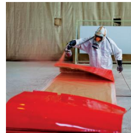
Aircraft and Component Painting