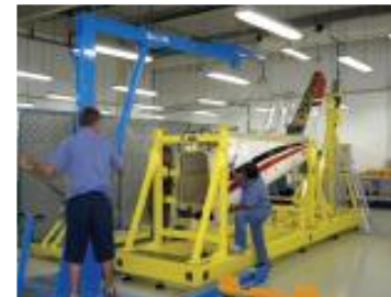
Structure: Repair Overhaul Manufacture