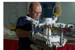
Component Overhaul And Maintenance