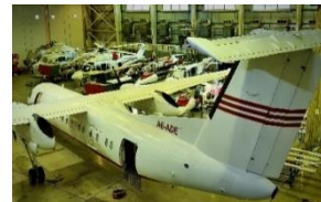
Fixed wing Hangar