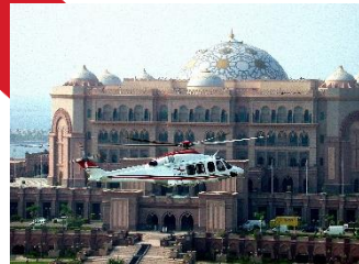
VIP Charters & Air Taxi