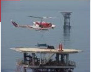
Offshore Oil & Gas Support including oil spill containment