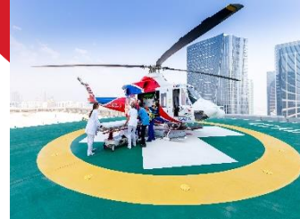
Emergency Medical Services