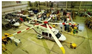
Rotary wing Hangar