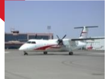
Regional Fixed Wing Operations