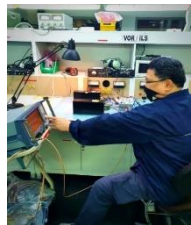
Avionics Overhaul And Maintenance